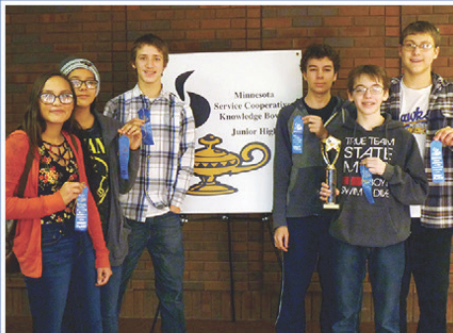
1st Place Montevideo Thunder