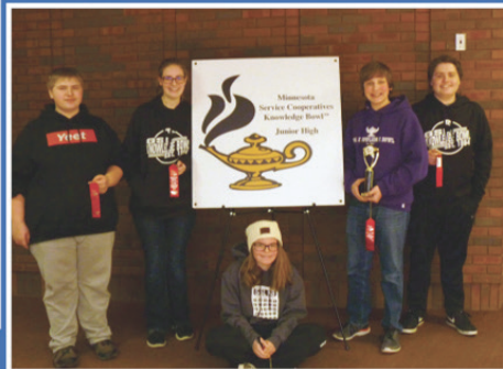
2nd Place GSL Black