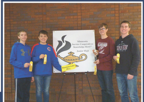
3rd Place MLPS Olive