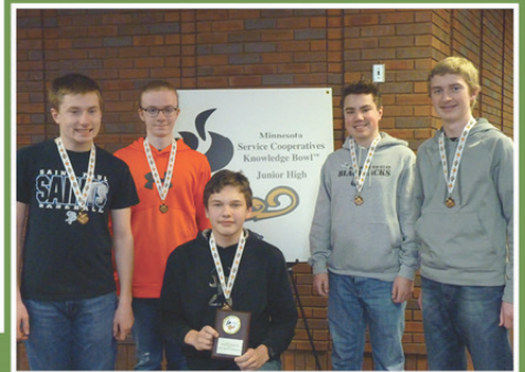
3rd Place Dawson-Boyd I

You can find more pictures and information by visiting www.swsc.org/KB .