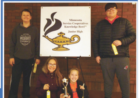
3rd Place Willmar Red