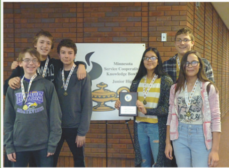
1st Place Montevideo Thunder