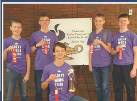
2nd Place MCC 4