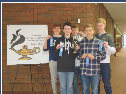
1st Place JCC I