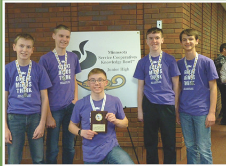
2nd Place MCC 4